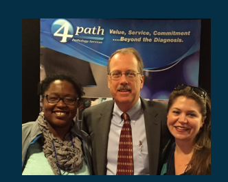
Indiana Podiatric Meeting

There was a great turnout at the Indiana Podiaty Meeting on Oct 17. On Friday evening, we had a fun time at Black Acre Brewery. Plan to attend the brewery next year